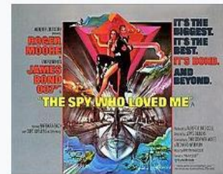
Theatrical release poster by Bob Peak